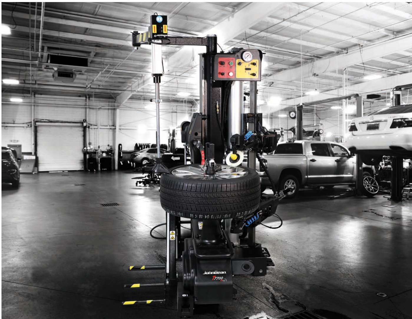
Shown with optional pneumatic wheel lift.