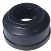
8-02040A2 PRESSURE CUP

» For use with Quick Nut (HD) 140-405-012