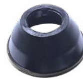
EAC0058D07A PRESSURE CUP

» For use with Quick Nut (standard) EAA0263G66A